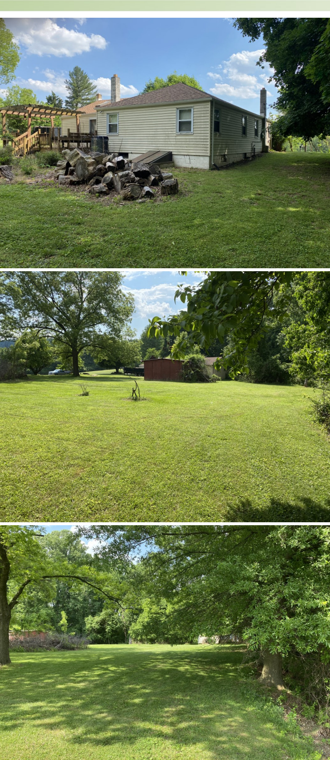
Disclaimer: Information obtained from sources deemed to be reliable. However, we make no guarantee, warranty or representation. Information, prices, and other data may change without notice.